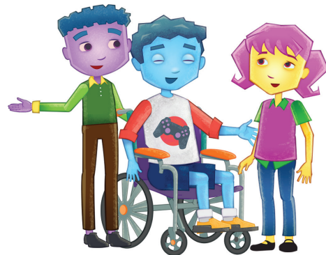
Characters from The Compassion Project digital course

Concepts like empathy are explored through digital activity learning extensions that can be done as a class or individually